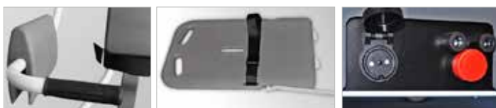
Comfortable back rest that can easily be moved to either arms for back support.