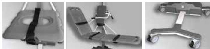
Commode seat on chair can be converted to smooth seat with lid placement.